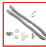
Includes Dust Control Hardware