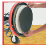
Easy Mount Disc Pad Driver